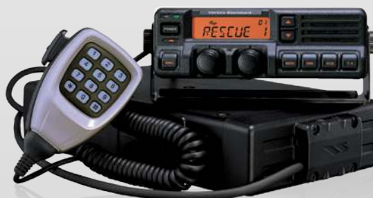
REMOTE MOUNT CONFIGURATION