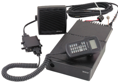
Handheld Controller shown with 5326 100-watt trunk-mount mobile and junction box. External speaker (PN 250-0151-005), also shown, is ordered separately.