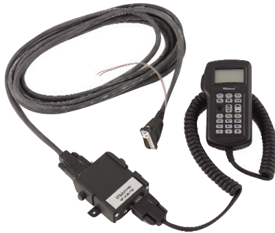
HHC Kit 250-5300-101